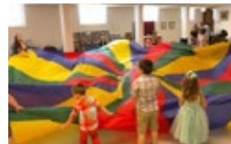
The children unveil the new Sunday School parachute on Easter morning.