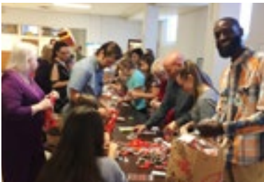
TO – preparing blessing bags