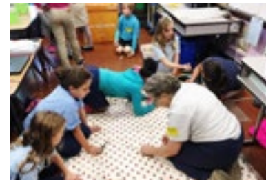
WITH – Epiphany members serve with Woerner students to make quilts to send overseas

“Service to” stands for what people often consider as “charity”—giving things to people. This could include money, clothing, food, or other basic needs. This type of service is most appropriate for relieving an unexpected crisis to “stop the bleeding,” such as with a flood or a house fire.