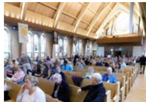
On Easter the risen Jesus brought together over 150 sisters and brothers at Epiphany, most of whom were once strangers