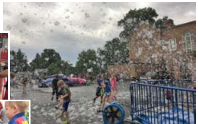
The bubble truck in action as the storm approached.