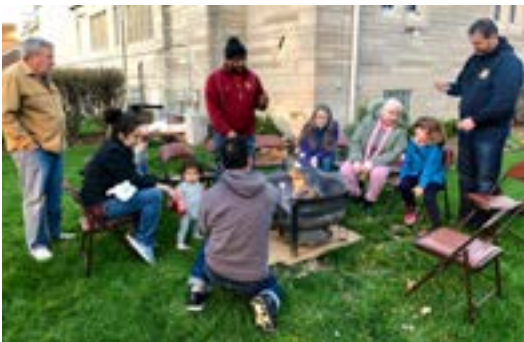
"Have fellowship with us" (1 John 1:3)