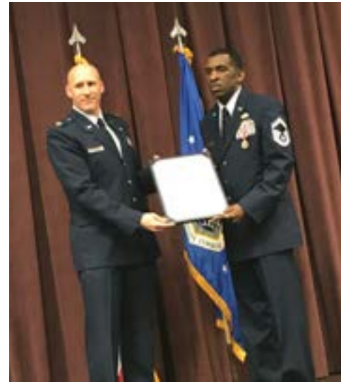
Photo taken at Scott Air Force Base, IL, May 4th, 2018