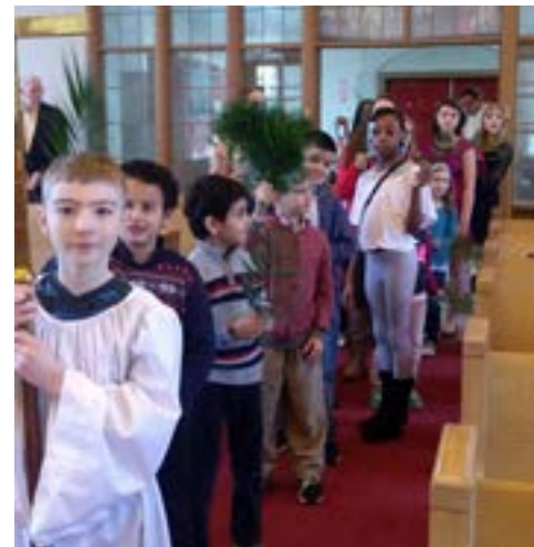
On Palm Sunday King Jesus gathered many nations for worship and fellowship around His Word