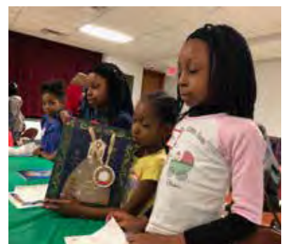
For the last four years, Epiphany has partnered with other LCMS churches to connect through hospitality by hosting the Christian Friends of New Americans Children’s Christmas party.