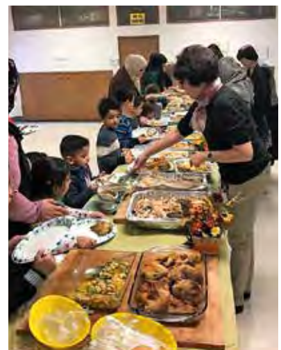
Epiphany ESL volunteers and church members connected with guests at a Thanksgiving meal in 2017.